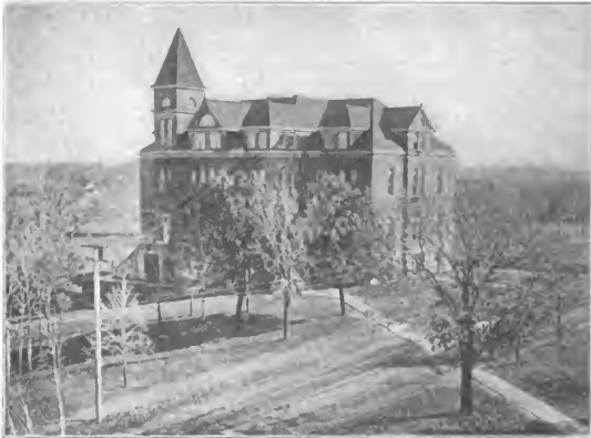
ATCHISON HALL, MIDLAND COLLEGE.

gelical Lutheran church. For years the ministers of the church had felt the need of a college in Kansas, to educate the youth of the church and prepare young men for the ministry. In 1885 a petition was presented to the synod asking for the establishment of such an institution. The synod decided to locate the college in the town which would make the most liberal donations. Atchison pledged $50,000 for suitable buildings and gave a tract of 25 acres of land in Highland park for a site, and was therefore chosen. The main building, Atchison Hall, was erected